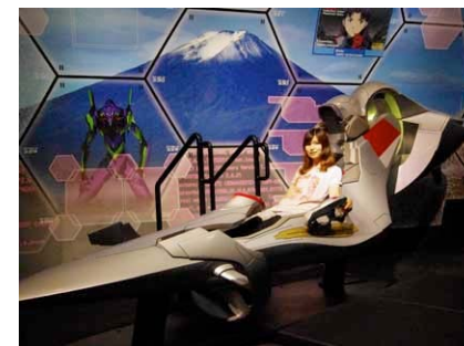
The Evangelion pavilion at the Fuji-Q Highland amusement park.