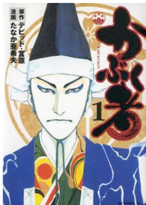
Kabukumon (The Deviant). (C)David Miyahara・Akio Tanaka/Kodansha

In the past, young people have tended to think of Kabuki and Noh as impenetrable and inaccessible, but a number of popular manga set in the world of the classical theater have sparked new interest in the traditional performing arts.