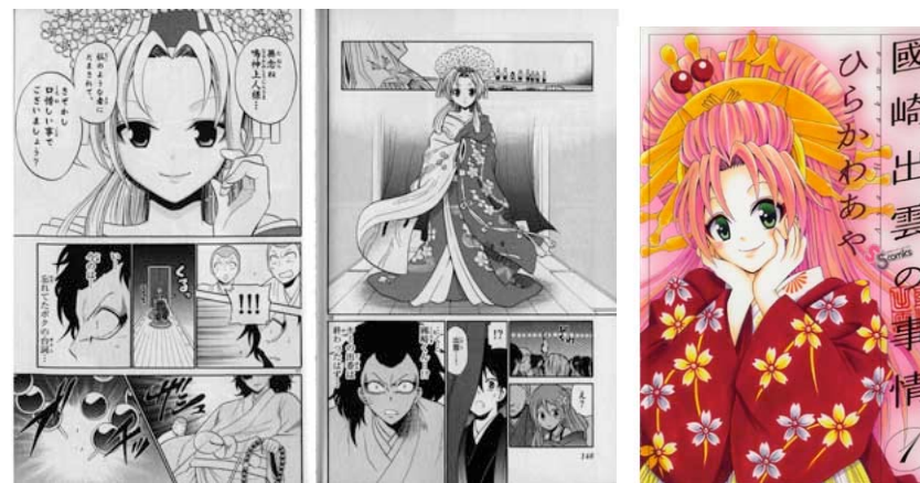
Kunisaki Izumo no Jijo. (The Circumstances of Kunisaki Izumo). (C)Aya Hirakawa/Shogakukan