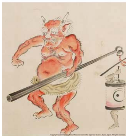
A red devil ( akaoni).

In June 2010, the International Research Center for Japanese Studies published an online "Database of Images of Strange Phenomena and Yokai (Monstrous Beings)", introducing people around the world to the monsters and folk beliefs that frequently appear in Japanese pop culture classics like the anime masterpieces of director Miyazaki Hayao.