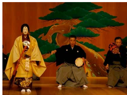
A Noh performance.