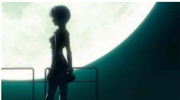
A scene from the new Evangelion movie (Ayanami Rei).

Evangelion , is one of the best-known works of anime, with millions of fans all over the world. Fifteen years after its debut, Evangelion continues to evolve and capture new fans. In 2010 a new chapter was added to the story of this legendary anime.