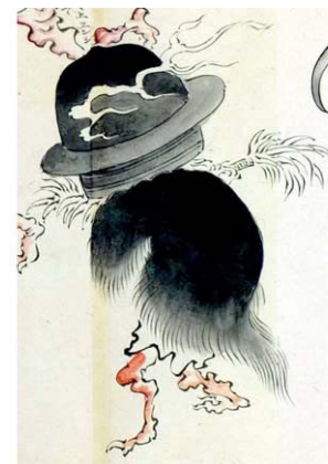
A furry monster with a cauldron over its head.