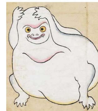
Even monsters get embarrassed.