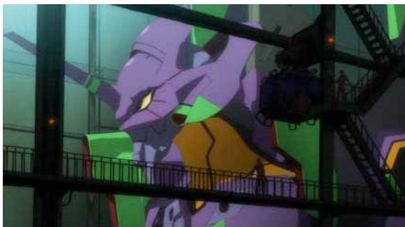
A scene from the new Evangelion movie (an Evangelion).