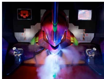
The Evangelion pavilion at the Fuji-Q Highland amusement park.