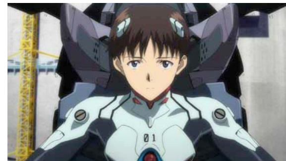
A scene from the new Evangelion movie (the hero Ikari Shinji).