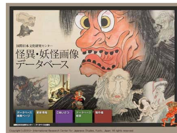
The main page of the "Database of Images of Strange Phenomena and Yokai (Monstrous Beings)" site. (C)International Research Center for Japanese Studies

(C)International Research Center for Japanese Studies