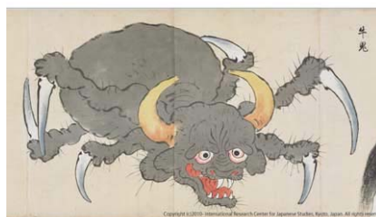
An ox demon ( ushioni ).