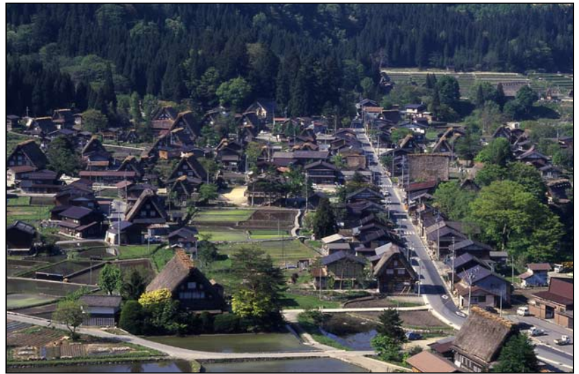
Shinto shrine architecture ( kasuga-zukuri ).

From 710 to 784, Nara served as the capital of Japan. Absorbing cultural (literature, art, architecture, etc.) and religious influences from Tang China, the city became a prosperous center of Japanese culture. Nara was long the most important center of Buddhism in Japan and this legacy is well represented in the World Heritage properties. Most striking is the Great Buddha Hall of the temple Todaiji. One of the largest wooden structures in the world, it houses the 15-meter bronze statue known as the Great Buddha of Nara. Important examples of Buddhist architecture can also be found at the temples Kofukuji, Yakushiji, and Toshodaiji. The Kasuga Shrine is noted for its unique style of