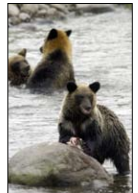
Shiretoko These brown bears are fishing in a river in Shiretoko Peninsula, a virgin mountain region consisting of forests, caldera lakes, and volcanoes.