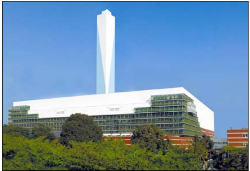
Itabashi Incineration Plant

The Fundamental Law for Establishing a Sound Material-Cycle Society was enacted in 2000 to serve as the basis for a comprehensive and systematic approach to waste and recycling. It was followed by a number of other new recycling laws covering specific areas such