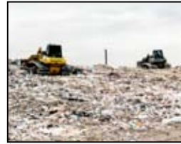
Outer Central Breakwater Landfill Site

This huge landfill site located on reclaimed land in Tokyo Bay is used for disposal of solid waste generated by Tokyo's 23 wards.