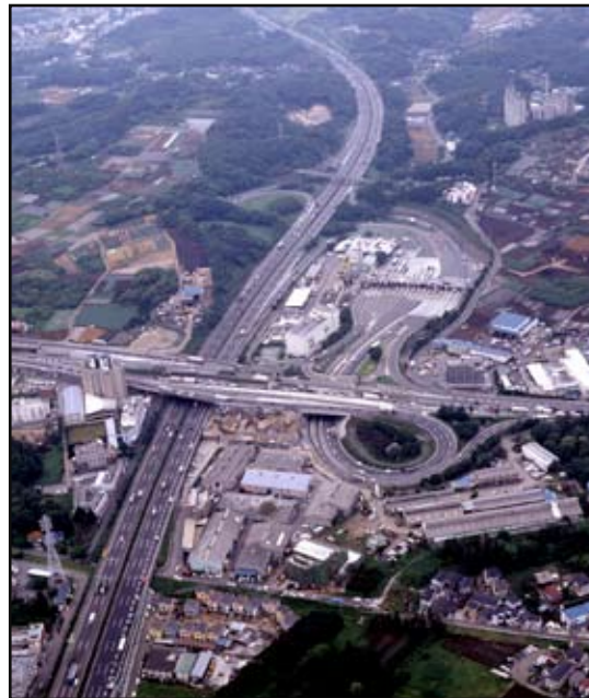
Tomei Expressway An aerial view of the Yokohama-Machida interchange in Kanagawa Prefecture.

Air pollution from motor vehicle emissions, including both exhaust gasses (nitrogen oxide, etc.) and the particulate matter emitted by diesel engines, is a serious problem in