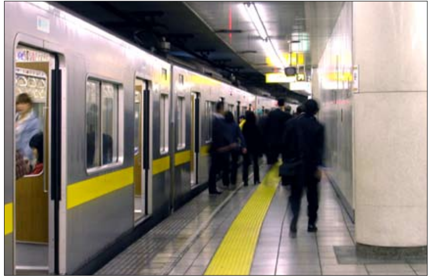
A Tokyo subway station

Development has also been proceeding on a new type of Shinkansen based on linear motor technology. This train levitates above its track using magnetic energy and is capable of reaching maximum speeds over 550 kilometers per hour (342 MPH). If completed sometime early in the twenty-first century, such "mag-lev" trains can be expected to make the journey between Tokyo and Osaka