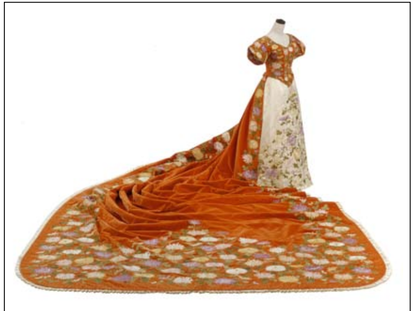
Imperial fashion A Western-style formal gown worn by Empress Shoken, the wife of Emperor Meiji.

After the beginning of the Meiji period (1868–1912), Western-style uniforms were adopted for persons serving in the military services, for policemen, and for postal carriers. This provided a particularly strong impetus to the great changes that occurred over time in Japanese dress. However, in the early Meiji period the kimono predominated. For formal occasions men typically wore haori (traditional waistcoats), hakama , and Western-style hats (Figure 11), while some women, otherwise dressed in Japanese style, took to wearing Western-type boots (Figure 12). This mixed Japanese-Western style of boots with kimono may still be seen today among young women attending university graduation ceremonies.