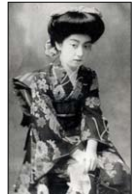
Hybrid style In the Meiji period (1868–1912) a combination of traditional Japanese clothing and Western hairstyles became popular.

In an era when overseas travel was still out of the question for most people, movies were a major source of information on overseas fashion. Many foreign films were shown in Japan, giving the Japanese people opportunities to see European and American