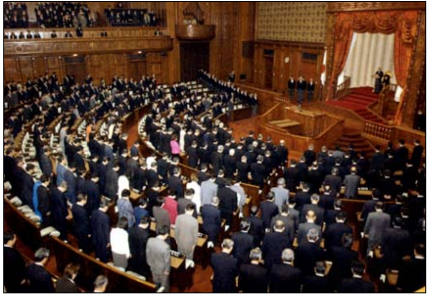
Diet session Emperor Akihito, on the stage at upper right, performs the convocation of the Diet at the opening ceremonies of a Diet session.

One must be at least 25 years old to be eligible for election to the House of Representatives. The number of members of the House of Representatives is 480. Of these, 300 are chosen according to the single-seat constituency system, by which just one person is elected from each district. The other 180 are chosen as per a proportional representation system whereby seats are distributed to