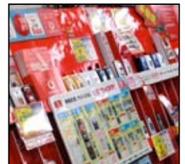
Mobile telephones Low rates and a variety of services have spurred sales for mobile telephones.

Looking ahead to the digital terrestrial broadcasting of TV and radio that is being gradually introduced between 2003 and 2006, a 1999 revision of the Broadcasting Law made