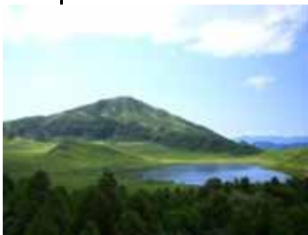
Mount Aso in Kumamoto Prefecture

Okinawa Prefecture is a chain of 60 islands located far to the south of Kyushu. Okinawa, once called Ryukyu, was an independent kingdom until the seventeenth century and, as such, developed its own distinct dialect and cultural traditions. After World War II and until 1972, Okinawa was controlled by the U.S. military. Tourism is the main industry. Because of the warm climate throughout the year, marine sports are popular. There are many beautiful islands in Okinawa, such as Ishigaki-jima and Miyako-jima, known for their coral reefs.