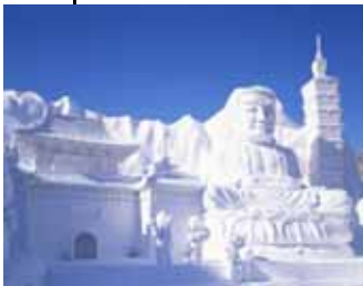
Snow Festival in Sapporo

The capital city, Sapporo, is famous for the Snow Festival held in early February, with many large sculptures made of snow and ice on display, forming spectacular scenes. Hakodate, a large city in the south of Hokkaido, is noted for its beautiful night views. Within Japan's system of prefectures, Hokkaido alone is categorized as a "circuit," though it is the equivalent of a prefecture.